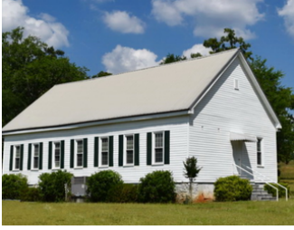
Flat Shoals PBC 2052 FAIRVIEW ROAD, STOCKBRIDGE, GA