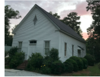
Shoal Creek PBC 65 SHOALS CREEK CHURCH RD, MANSFIELD, GA