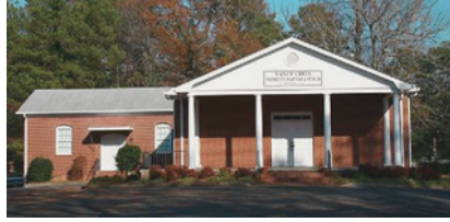
Nancy Creek PBC 1685 8 TH STREET, CHAMBLEE, GA